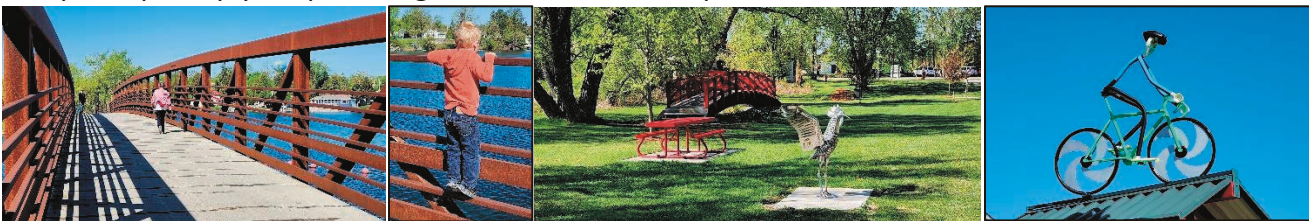
Park photos by Neil Jordheim

Red Bridge Park adjoins Heartland Park. What a place for a picnic, enjoy the art walk, walk on the Old Red Bridge or have your picture taken there, or fix your bike at the bike station. FHL&R donated a dock so you can tie up and pick up your pizza or go downtown and shop.